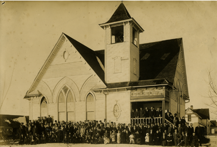
Photo taken soon after church was built.