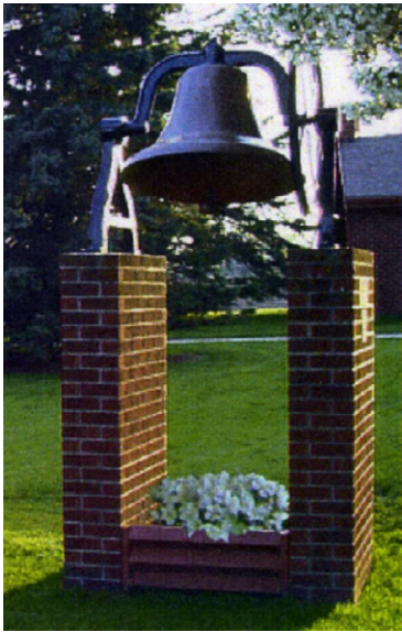
The original bell was moved in the fall of 2013 to a new steel bell structure which was built by church member Tom Ward.