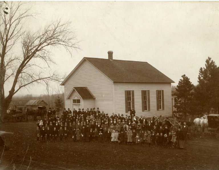
In 1903 the building was moved to Elkhart and augmented.

The church building was used from 1904 to 1963. A special 100th Anniversary Celebration was held in 1952. In 1966 the old white church building was removed.