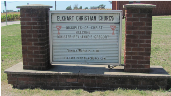
The church sign was replaced in 2014.